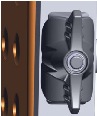
LOCK RAPID LOCKS TO SECURE