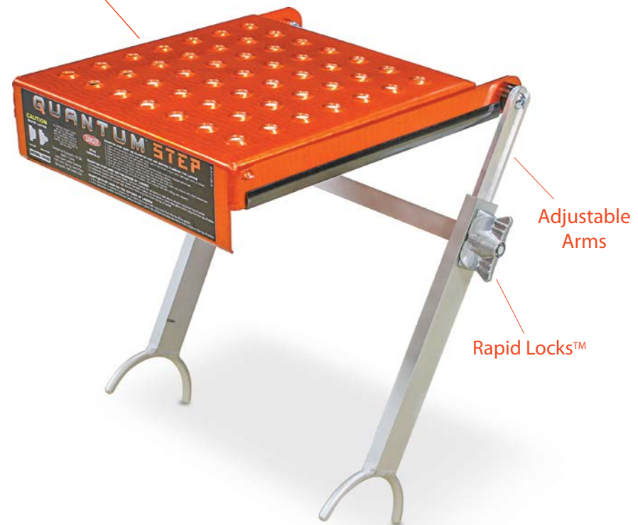
Anodized Step Platform

IF YOU ARE UNSURE HOW TO USE, PLEASE CALL LITTLE GIANT CUSTOMER CARE!